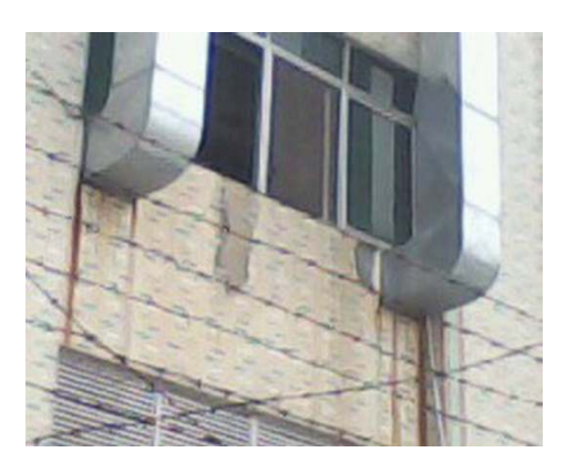
• Pic 12 Exterior view of the factory building.

floor of the dormitory building. Workers each can get three dishes and one soup. All tableware is sterilized, which many employees feel happy about.