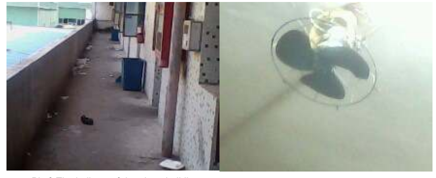
Pic 9 The hallway of dormitory building.