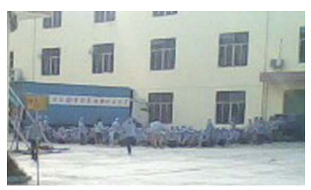
• Pic 2 On a morning meeting.

Employees have a weekly morning meeting with leaders in the factory, including supervisors of