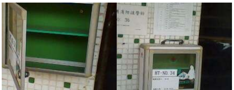
• Pic 4 Empty first aid kit.

air, almost as decorations. These supposed entertainment facilities are only there for looks. The factory's employees are only able to engage in a few activities in the nearby area, including surfing the Internet in an underground Internet cafe, crossstitching, or shopping.