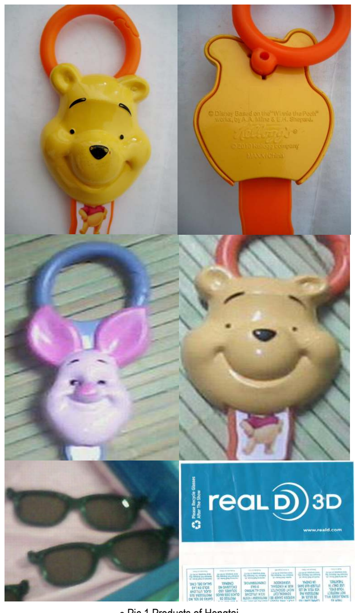
• Pic 1 Products of Hengtai.