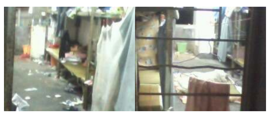
Pic 9 A dormitory Room

Every Monday through Saturday, a woman cleans the dormitories, however the cleaner's only responsibility is to clean the corridors of each floor. There is no one responsible for cleaning the dormitories or other living quarters. Walking through the dormitory corridors at noon, there is garbage everywhere, and the smell is slightly nauseating. A number of my fellow co-workers quit the job because of the poor conditions in the dormitories. Many others choose to live in outside dormitories. See the figures below: