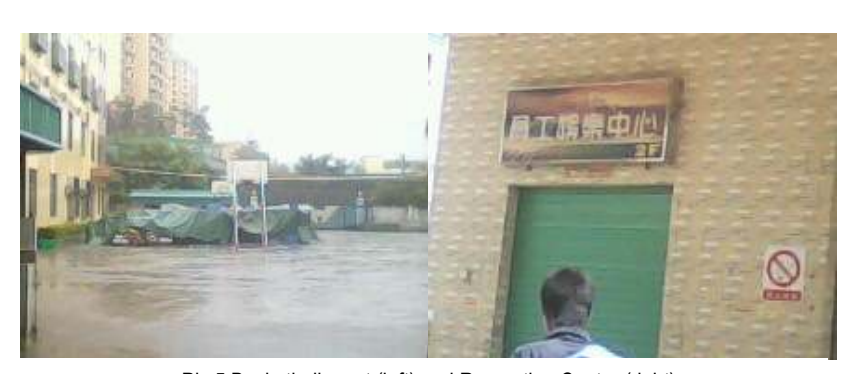
• Pic 5 Basketball court (left) and Recreation Center (right).

During the probation period, employees are not permitted to buy pension insurance. After the probation period has ended, if employees want to purchase insurance, they must fill out a written application, but only after they have paid for it in full. During the new employees training orientation, human resources staff tells workers, "You all are not from Guangdong province, buying this for such a short time is useless. Even if you buy it now, you cannot retire, so it is best not to buy it. But if you really want to buy it, wait until after the probation period is over and then apply."